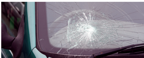
Chipped and cracked glass