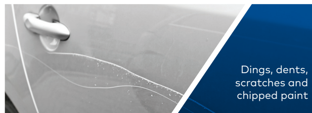
Dings, dents, scratches and chipped paint