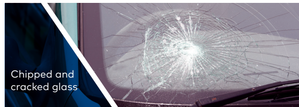
Chipped and cracked glass