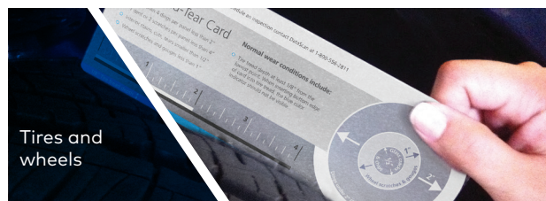
Tires and wheels