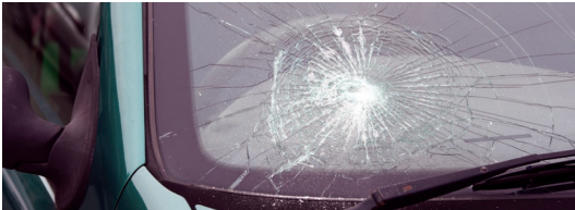
Chipped and cracked glass