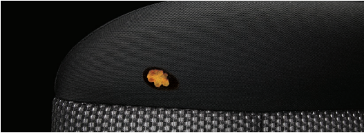
Stains, burns and tears on upholstery and carpet