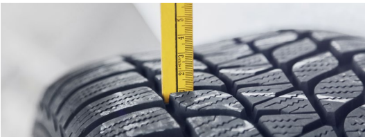
Tires and wheels