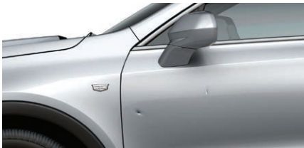
Fewer than 4 dings per panel, less than 2”