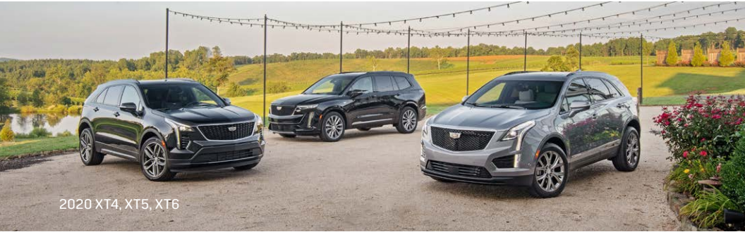
2020 XT4, XT5, XT6

Schedule a pre-return inspection within 120 days of lease end for a report on wear and use and how that can affect amounts owed at lease end. See pages 6-9 for more details on wear and use.