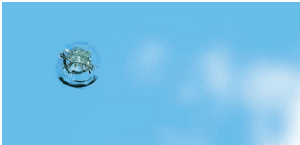
Cracked glass equal to or less than 1/2” in diameter