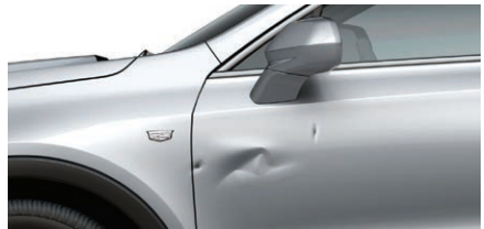
Hail damage or punctures on any panel