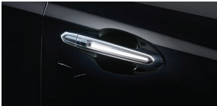
1 dent or 2 scratches (equal to or less than 4”) per panel