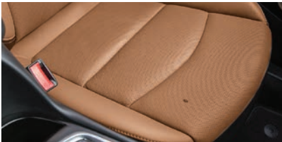
Upholstery holes equal to or less than 1/8"