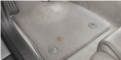
Removable stains and minor carpet wear