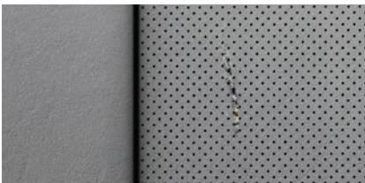
Tears equal to or less than 1/2"