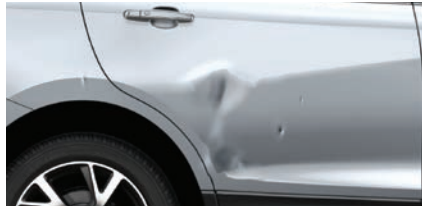
Hail damage or punctures on any panel