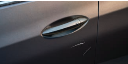
1 dent or 2 scratches (equal to or less than 4”) per panel