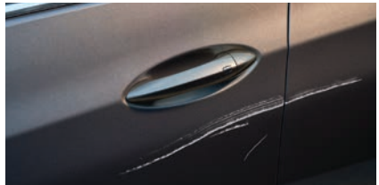
1 dent or 2 scratches (more than 4”) per panel