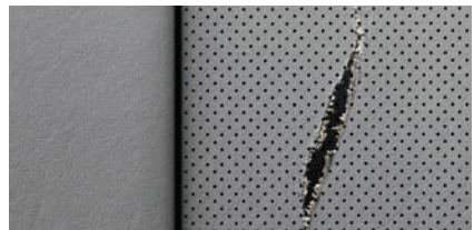
Tears more than 1/2"