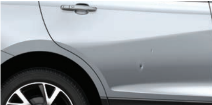
Fewer than 4 dings per panel, less than 2”