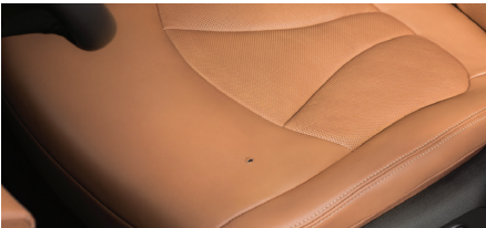
Upholstery holes equal to or less than 1/8"