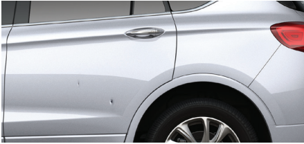
Fewer than 4 dings per panel, less than 2”