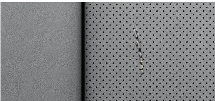
Tears equal to or less than 1/2"