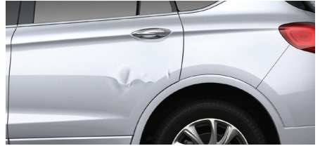
Hail damage or punctures on any panel