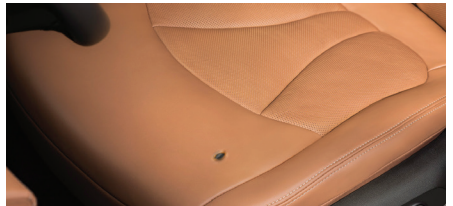
Upholstery holes more than 1/8"