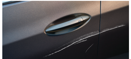
1 dent or 2 scratches (more than 4”) per panel