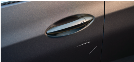
1 dent or 2 scratches (equal to or less than 4”) per panel