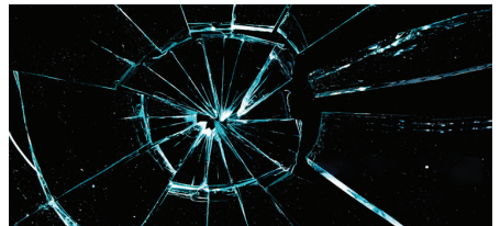
Cracked glass more than 1/2” in diameter or spidered cracks