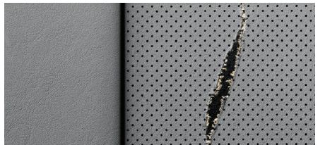
Tears more than 1/2"