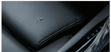
Upholstery holes more than 1/8"