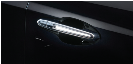
1 dent or 2 scratches (equal to or less than 4”) per panel