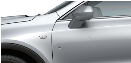
Fewer than 4 dings per panel, less than 2”