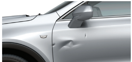
Hail damage or punctures on any panel