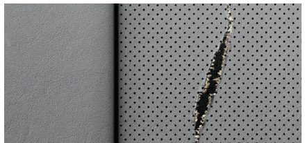
Tears more than 1/2"