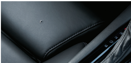
Upholstery holes equal to or less than 1/8"