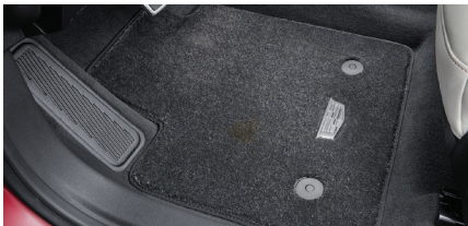
Removable stains and minor carpet wear