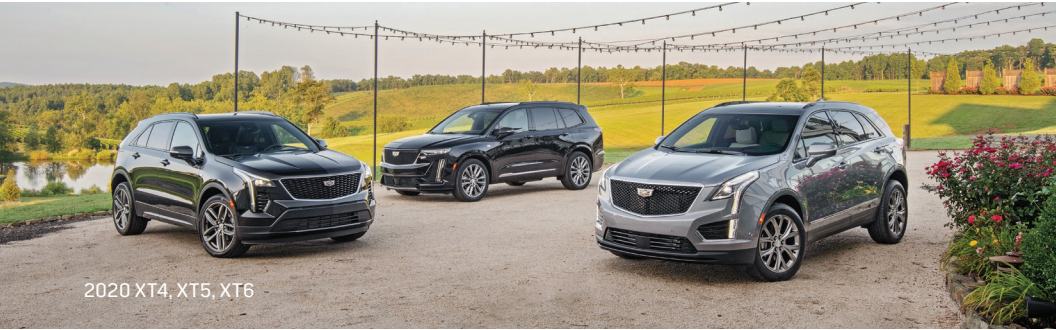
2020 XT4, XT5, XT6

Schedule a pre-return inspection within 120 days of lease end for a report on wear and use and how that can affect amounts owed at lease end. See pages 6-9 for more details on wear and use.